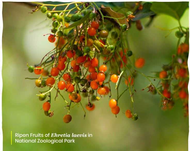
Ripen Fruits of Ehretia laevis in National Zoological Park

Because the bark of this tree chewed like Paan and stains the teeth red therefore it is also called Datranga in its native range. Its powdered bark is mixed with flour to make dough during famine. The fruit is edible and leaves are a valuable fodder resource in the areas where grass is scarce.