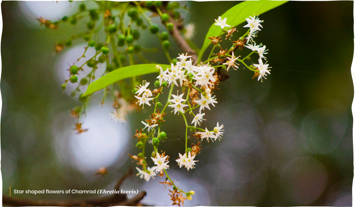
Star shaped flowers of Chamrod ( Ehretia laevis )

A middle sized tree of tropics, Ehretia laevis is an important part of native Delhi flora and can be recognized by its gnarled, knobby trunk. During Feb–March it can be recognized by its distinctive star shaped, small, white flowers. It is widely distributed in India and in Myanmar, Sri Lanka, Vietnam, South China and part of North Australia.