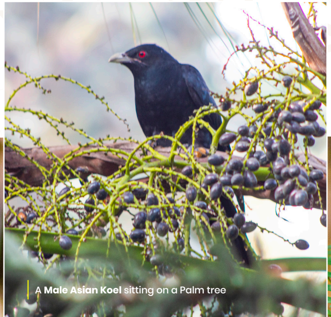
A Male Asian Koel sitting on a Palm tree

months. National Zoological Park resonates by the distinctive calls of these species of Cuckoos, the brain-fever...brain-fever...brain-fever of Common Hawk Cuckoo, crossword.....puzzle..... of Indian Cuckoo, and koel...koel..koel... of Asian Koel.